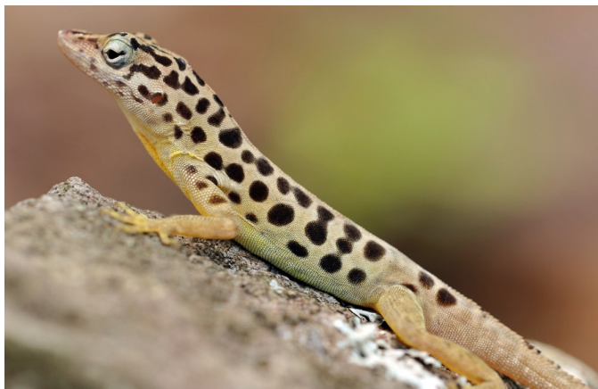
Fig. 1. Adult male Saba Anole ( Anolis sabanus ).

St. Eustatius is unusual among inhabited Lesser Antillean islands in that during the past century, only one exotic herpetofaunal species has established a viable population on the island. The parthenogenetic Flowerpot or Brahminy Blindsnake ( Indotyphlops braminus ) likely arrived on the island during the 1990s via shipments of ornamental plants originating in Florida (e.g., Powell et al. 2011, 2013). However, the time and origin of this introduction remains obscure and could date back further, as this species has a nearly cosmopolitan tropical distribution. Introduced populations of Tropical House Geckos ( Hemidactylus mabouia ; locally called Woodslaves) and Johnstone's Whistling Frogs ( Eleutherodactylus johnstonei ) have been established since at least the 19th Century. However, stray individuals of two exotic species have been recorded in recent years. A few Red-eared Sliders ( Trachemys scripta elegans ) were kept in a private ornamental pool for several years (Powell et al. 2015). In 2013, a juvenile Green Iguana ( Iguana iguana ) was discovered in the cargo shipment of a vessel that had originated from Saba. That individual was