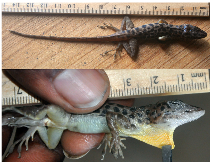
Fig. 3. The adult male Saba Anole ( Anolis sabanus) captured on St. Eustatius.