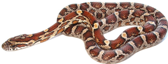
Fig. 1. Hatchling Red Cornsnake ( Pantherophis guttatus ) found alive on 25 October 2012 near Cherokee Sound, Abaco Island, The Bahamas (26.2835/-77.03469) (UF 169221).

I collected two Red Cornsnakes (Figs. 1 & 2) on Abaco Island, The Bahamas in October and December 2012 near the town of Cherokee on the eastern coast of Abaco. No available data point to the origin(s) of these snakes. The identification was confirmed by Dr. Kenneth L. Krysko, Florida Museum of Natural History. Collection sites were within 1 km of one another. Both snakes were found in a low-density residential area dominated by low, evergreen forest (coppice)