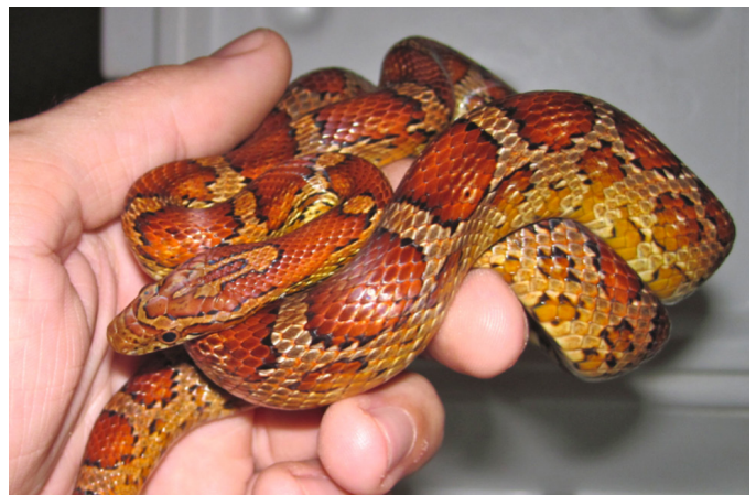
Fig. 2. Adult Red Cornsnake ( Pantherophis guttatus ) found alive on 2 December 2012 near Cherokee Sound, Abaco Island, The Bahamas (26.29015/-77.03432) (UF 169222).

consisting of Thatch Palm ( Thrinax radiata ), Mahogany ( Swietenia sp.), Poisonwood ( Metopium toxiferum ), and Gumbo Limbo ( Bursera simaruba ).